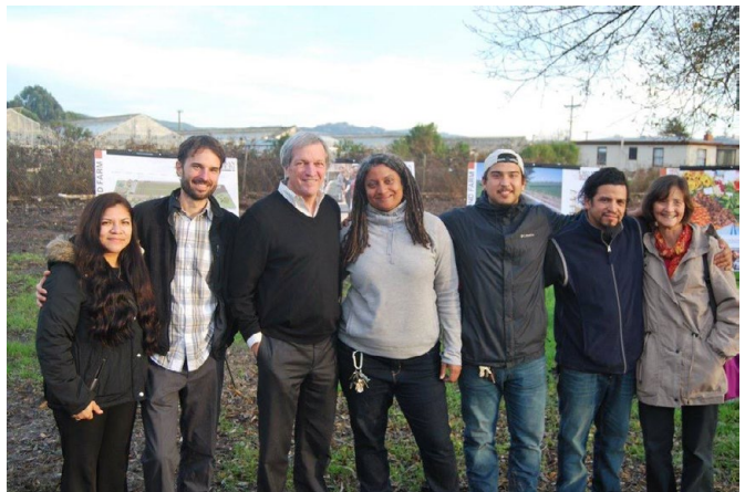
California Congressman Mark DeSaulnier with the Urban Tilth team in Richmond, California

UC Berkeley’s Haas School of Business could provide technical assistance related to financial planning and business models for small businesses, small farms, and community-based organizations working in the food and agriculture sector. The Social Sector Solutions program in the Haas School of Business already partnered with the City of Richmond and published a report entitled, The Richmond Bay Campus Report: Strategic Business Plan and Marketing Strategy Positioning Richmond for Success , 47 which outlines a strategic business plan for the new Berkeley Global Campus that focuses on best practices for procurement as well as a marketing strategy for the City of Richmond. 48 Similar efforts could be made to follow-up on this type of research and work directly with local stakeholders in Richmond’s food economy to support their sustainability, impact, and growth.