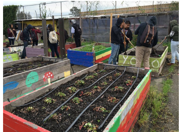
School garden in Richmond

A recent study analyzing access to food in Richmond found that about 32,000 people (34 percent of the study area population) in Richmond reside in "critical food access areas," or "areas considered underserved when compared to the study area as a whole." 17 These areas include North Richmond, the Iron Triangle neighborhood, and South Richmond. On average, Richmond residents must travel almost a mile to reach a full service grocer, though some residents must travel even further to access food. Given that approximately 10 percent of households in Richmond do not have a vehicle, these distances to food retailers have a significant impact on accessibility to whole and healthy foods. 18 According to the same study, these food challenges, and resulting health