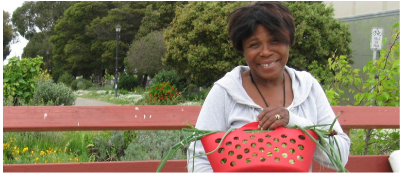
Richmond resident harvesting from the Greenway

The BGC could potentially provide a wide range of opportunities for local food businesses on its new campus. One approach to this would be to incentivize locally-owned food businesses and businesses owned by members of marginalized communities to contract with and become vendors on the new campus. These contracts should include responsible contracting policies to ensure that any and all food jobs ensure worker security, equity, and health. In so doing, the campus would create local jobs and opportunities to start new businesses that help support the local economy and social sustainability. The new campus can also institute a weekly farm stand and promote Community Supported Agriculture boxes on the new campus that feature local produce from organizations like Urban Tilth and other local growers in Contra Costa County. These farm stands could also implement a “Double Up Food Bucks” program so that customers can purchase goods with their EBT (electronic benefit transfer) cards to improve food access for low-income individuals. “Double Up Food Bucks” is a statewide incentive program that doubles the value of CalFresh benefits when used for fresh, locally-grown fruits and vegetables at farmers’ markets and grocery stores. An initiative like this would create a direct pathway for local farmers to sell to local residents while also providing whole, healthy foods to students, workers, staff, and faculty at the Berkeley Global Campus.