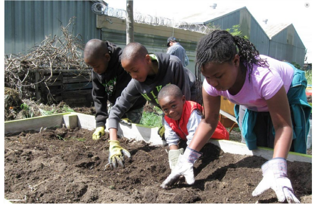
Richmond youth till soil at Adams Crest Farm

In addition, Richmond still faces extreme underenrollment in California's Supplemental Nutrition Assistance Program (SNAP), CalFresh. According to the Contra Costa County Employment and Human Services, approximately 40 percent of Contra Costa County residents who are eligible for federal food assistance programs are not enrolled. No data was available for underenrollment percentages in the city of Richmond, but it is possible that this percentage is higher than 40 percent for Richmond residents. This is despite the fact that enrollment in Contra Costa County's CalFresh program has increased 410% from 2006 to 2014. Currently, there are about 6,000 Richmond households (approximately 15,000 individuals) enrolled in CalFresh, out of a total population of 107,571. 21 There are many factors that can contribute to these gaps in enrollment, including: language barriers, fear that enrollment will impact immigration status, stigmas tied to federal assistance programs, misinformation about eligibility and benefits, administrative churning, and individuals thinking the benefits are too low to go through the hassle of enrollment. Finally, there is also the added barrier that the most recent 2014 Farm Bill has prohibited the use of federal funds toward advertising for SNAP or CalFresh programs. 22