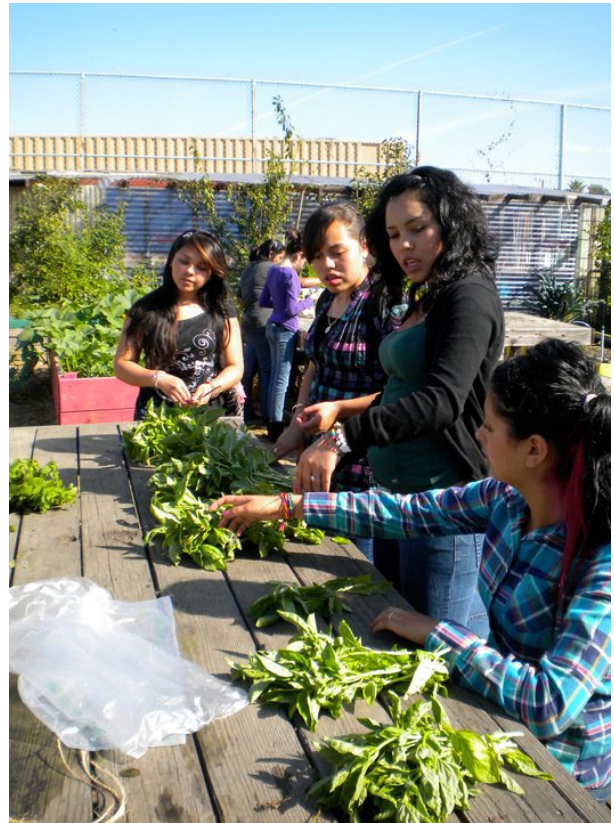
Richmond youth gathering basil from a local garden

This paper provides a general overview of food systems and community health, followed by a description of the current landscape of existing food challenges and food equity efforts in Richmond and food-related work at UC Berkeley and within the Global Food Initiative. The final section presents strategy recommendations that can bridge these broad-based initiatives housed within community, city government, and academia in a way that includes and centers the needs and contributions of marginalized communities. In so doing, these efforts can be better aligned to optimize meaningful collaborative work that can enhance opportunity structures within the food system in Richmond and UC Berkeley. Lastly, this paper aims to bring discussions around