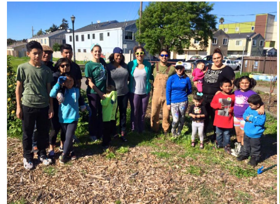
Volunteers working at garden on Richmond Greenway

While these food procurement goals are commendable, there is still room for improvement—not only in procurement, but also to better ensure that small to mid-sized farms have access to local markets. In addition, procurement strategies at UC Berkeley could be leveraged with other anchor institutions so that they have a broader reach and impact on the regional economy and local community. 38 Cal Dining has expressed interest in finding pathways to improving food sustainability and access at UC Berkeley. The Global Food Initiative aims to advance these issues as well. Some of the strategies mentioned in the next section might have the potential to achieve many of the goals of the GFI, BGC, and Richmond city government and community.