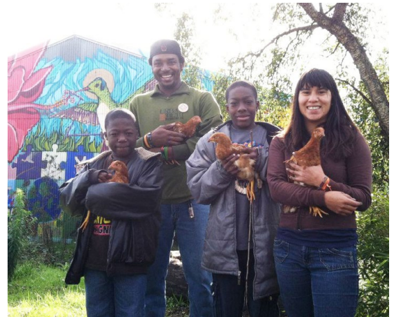
Richmond youth holding young chickens

A focal point of food equity and community health work in Richmond is Unity Park, a newly formed park on the Richmond Greenway—a 1.5 mile-long area that was previously railroad